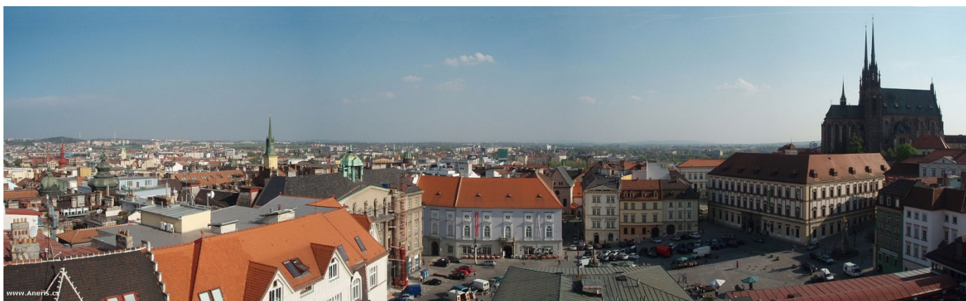
Brno Panoramic View

Thirty Years for Qualified Interpretation of European Cultural and Natural Heritage