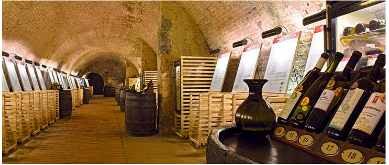
Lednice and National Wine Centre