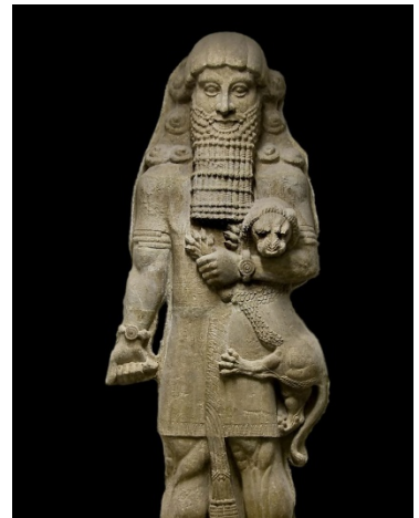
Punkva Caves and Gilgamesh from Louvre