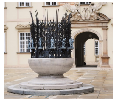
Hotel International Brno